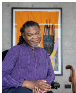
Yinka Shonibare CBE Founder and Chair

The G.A.S. team are on site Monday to Friday to support the needs of residents and help with booking trips and visits, organising meetings, accessing the library and delivering events and activations.